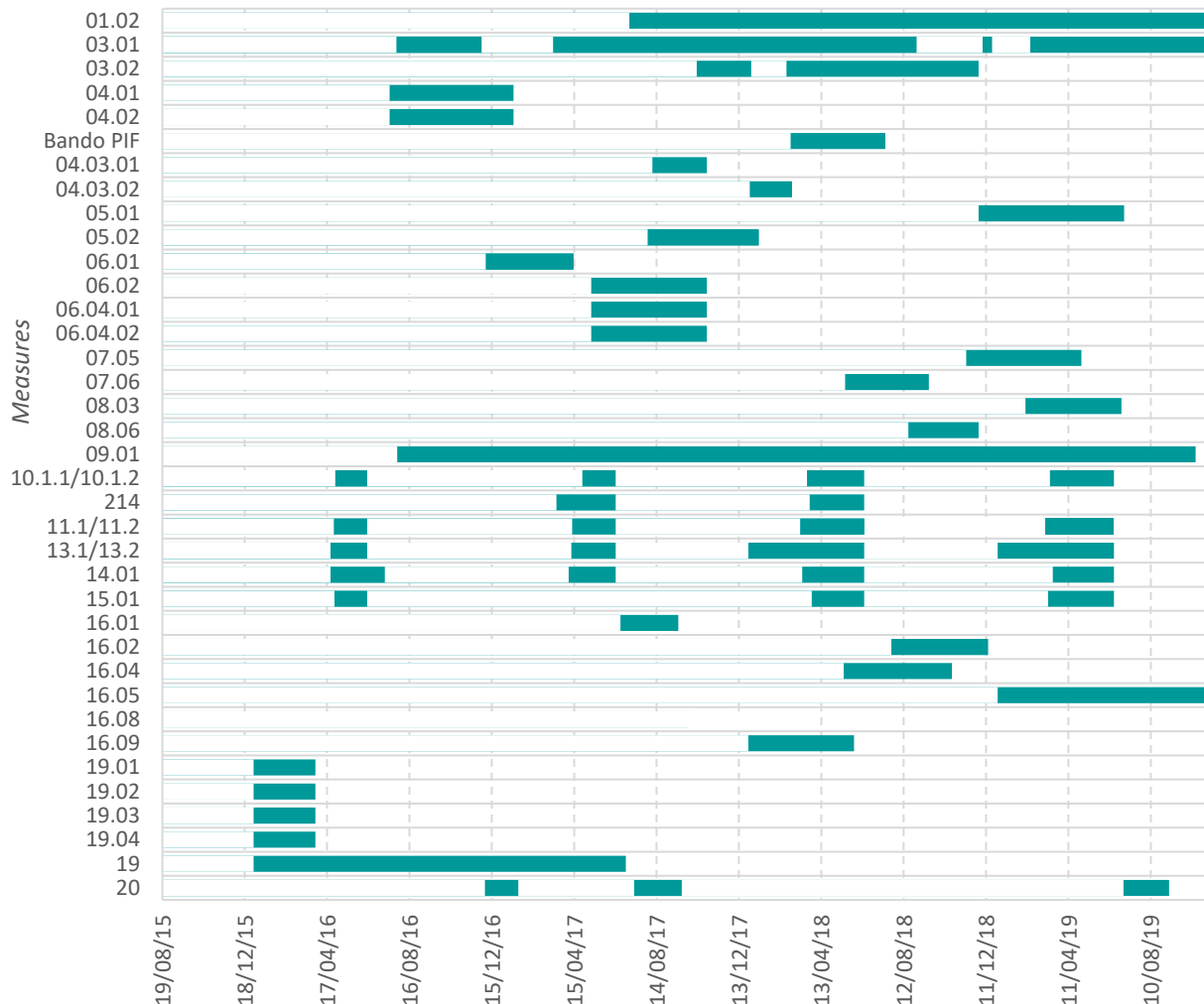
Fig. 1. Timing and duration (from publication to expiry) of the implementation procedures of the RDP 2014-2020

In terms of application forms, the measures with the best results were 4.1 and 6.1 as regards structural measures (Fig. 2), and 13 and 14 for area or animal based measures (Fig. 3).